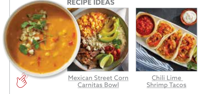
Mexican Street Corn Carnitas Bowl