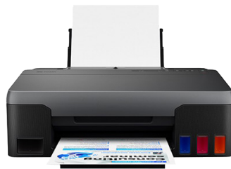
Pixma G1220 MegaTank Ink Printer

Showcase products with merchandising solutions