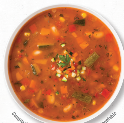
Campbell's® Signature Reduced Sodium Vegan Vegetable