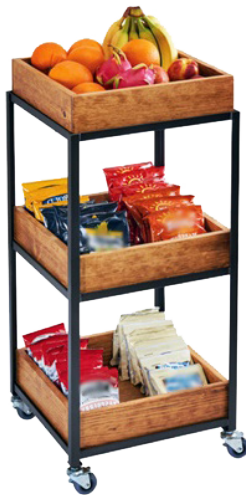
Three-Tier Bronze Metal & Rustic Pine Merchandising Cart

"I'm excited to boost employee morale with rewards and was able to award each of my 'employee of the month' winners an item. Thank you for assisting with this, Real Rewards Cafe! " - University of Arkansas for Medical Sciences, Little Rock, AR