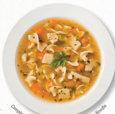
Campbell's® Signature Reduced Sodium Chicken Noodle