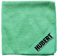
Green Microfiber Towel 16" x 16"

Here are great items to enhance your foodservice operation using Real Rewards Points.