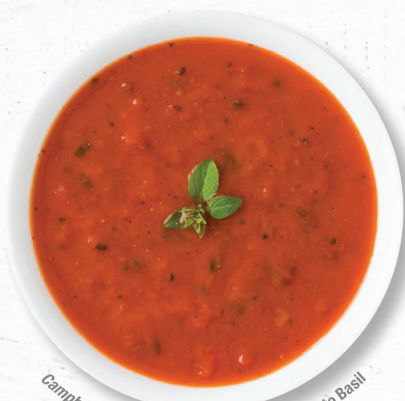
Campbell's® Signature Reduced Sodium Tomato Basil