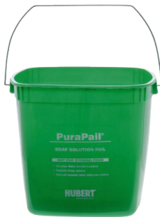
Green Plastic Sanitizing 6 qt. Utility Pail

Prevent cross contamination with color coded pails and towels