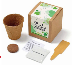
Growable Praise Plant Kits

ECO-Friendly: An alternative item that is deemed a better choice for the environment.