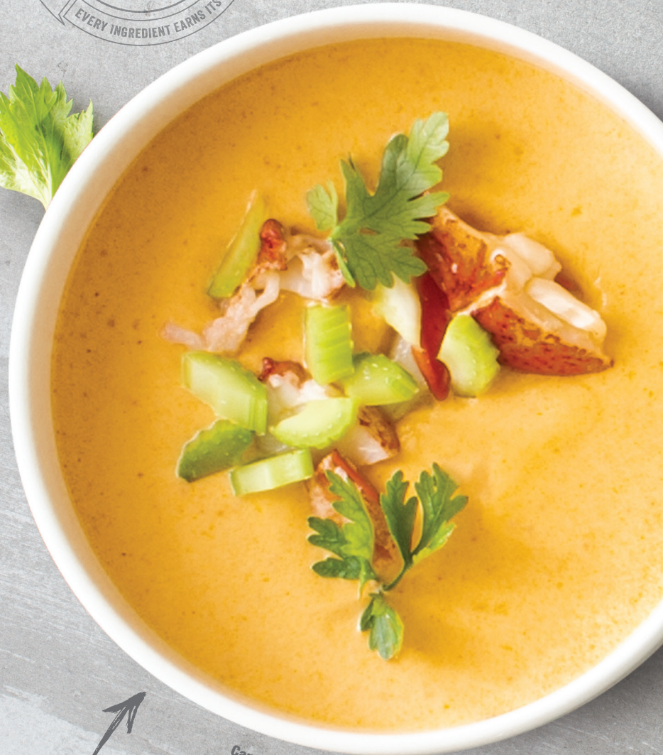
Campbell's® Reserve Lobster Bisque with Sherry

SOUP SALES HAVE GROWN IN THE SUMMER MONTHS FROM 2016 TO 2018 1