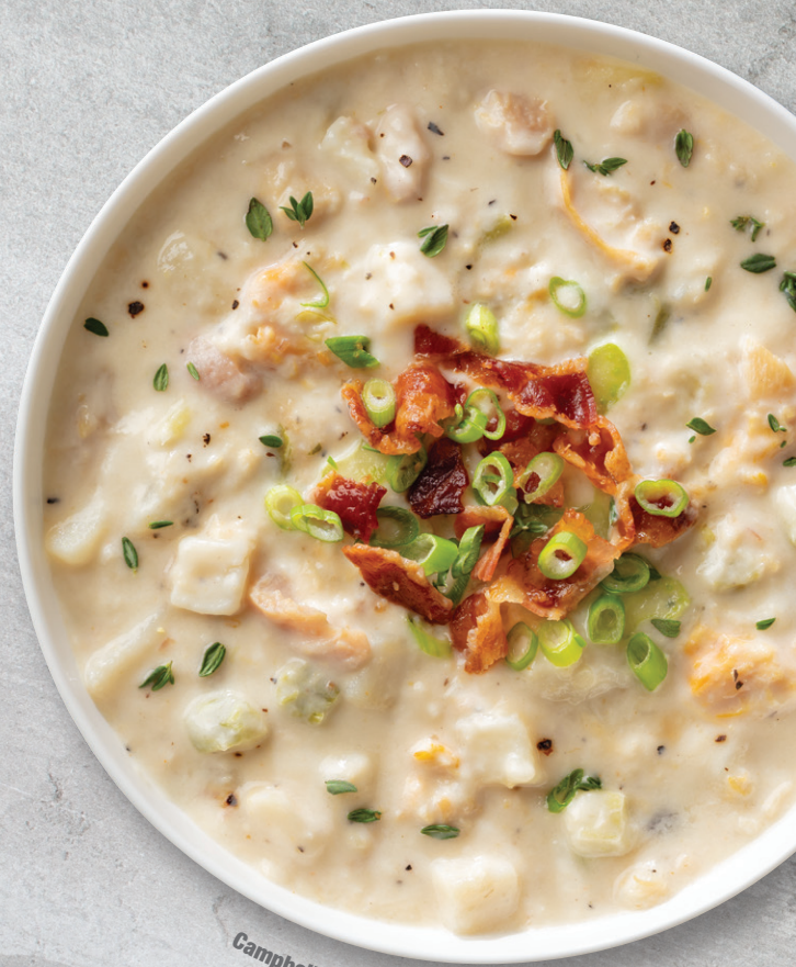
Campbell's® Reserve Loaded Clam Chowder

GARNISH TIP: Add texture and crunch by topping it off with seasoned oyster crackers, fried clam strips, crispy bacon planks or crispy potato sticks